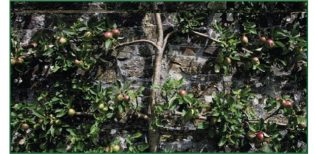
Espalier of apples

Outside espalier, fan and cordon fruit trees line the walls enclosing the garden. There are apples, pears, quinces, medlars, soft fruit, and two mulberry trees – and even Chinese gooseberries. They make the best use of the c.18th-century walls, which were all renovated between 1997 and 2000 after the collapse of one section. Juice from home-grown apples is available for purchase at the Visitor Centre.