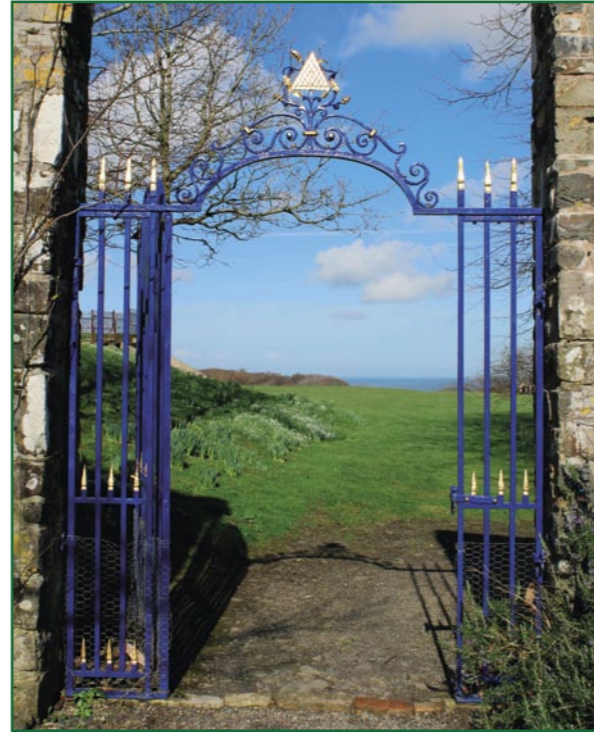
The restored blue gate

The recently restored blue gate towards the end of the garden leads out on to Clovelly Court Great Terrace, where on a clear day you can enjoy a view of Lundy (Norse for island of puffins) and a sweeping vista of Bideford Bay. It is a very popular location for marquee wedding receptions. Clovelly Court is the Manor House of the village and home of the Rous family.