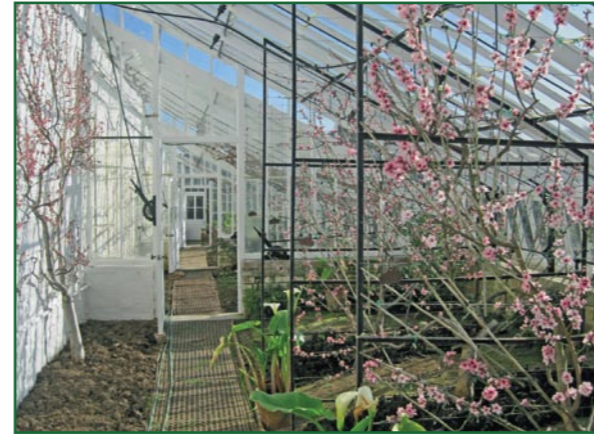
February peach blossoms

Peaches and apricots flower in February/March so have to be pollinated by hand since there are few bees around at that time. If you notice white sachets hanging from the trees, they contain predatory bugs that feed on the damaging red spider mite.