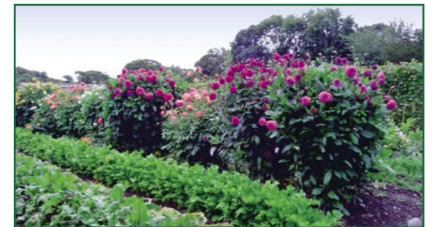
Growing cut flowers and produce