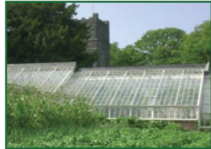
Glasshouses and (above to the left) All Saints Church

Tender and exotic plants thrive in this sunny corner of North Devon. It benefits from its enviable sheltered position in the Bristol Channel and the effects of the warm Gulf Stream flowing past Clovelly. Protected from the winds and bounded by an avenue of lofty lime trees, they are usually a month ahead of the season – but you'll find that there's always something to see and enjoy at any time of the year.